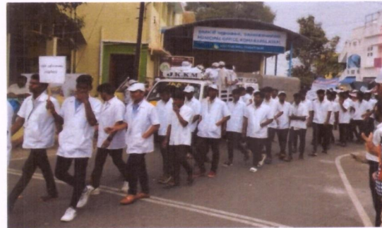
Pharmacist Day Rally