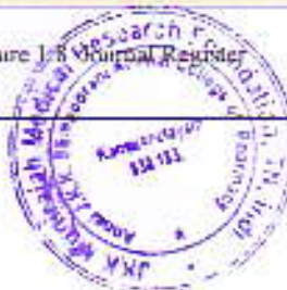
Figure 1.8 Journal Register