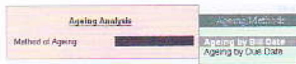
Figure 1.15 Ageing Methods