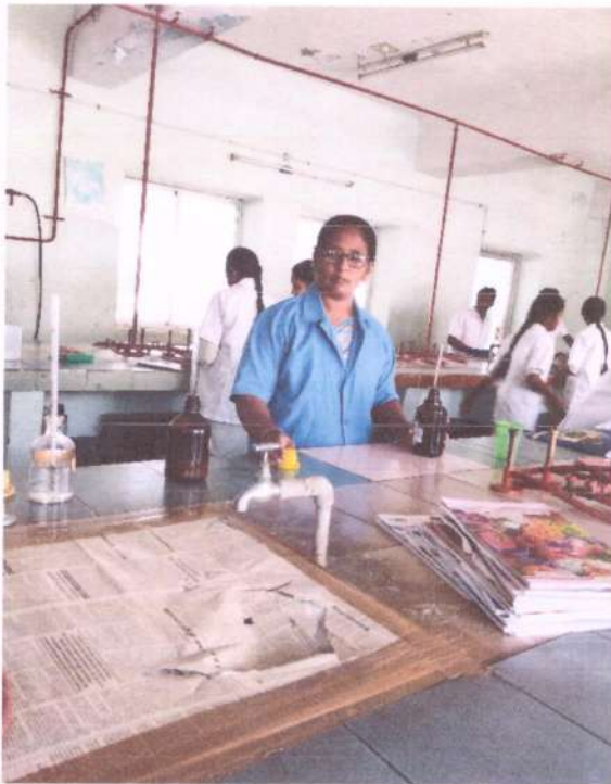
NON TEACHING STAFF UNIFORM

Ethirmedu, B.Komarapalayam – 638 183, Namakkal Dist. Tamilnadu. India Approved by : Pharmacy Council of India, New Delhi & The Tamilnadu Dr.M.G.R Medical University, Chennai. Website : www.jkkmmrfpharmacy.edu.in |E-Mail : principal@jkkmmrfpharmacy.edu.in Contact No. : +919789456750, +919943069944, +919943066944