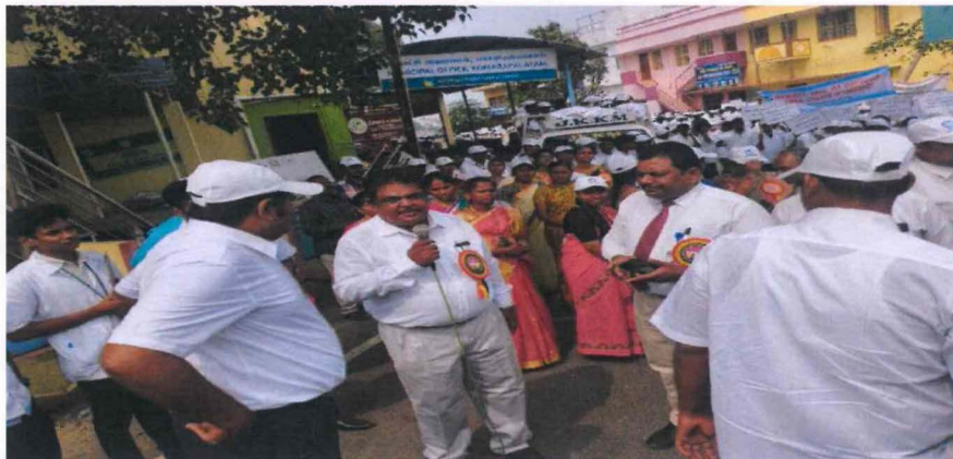
Rally for a Healthier World