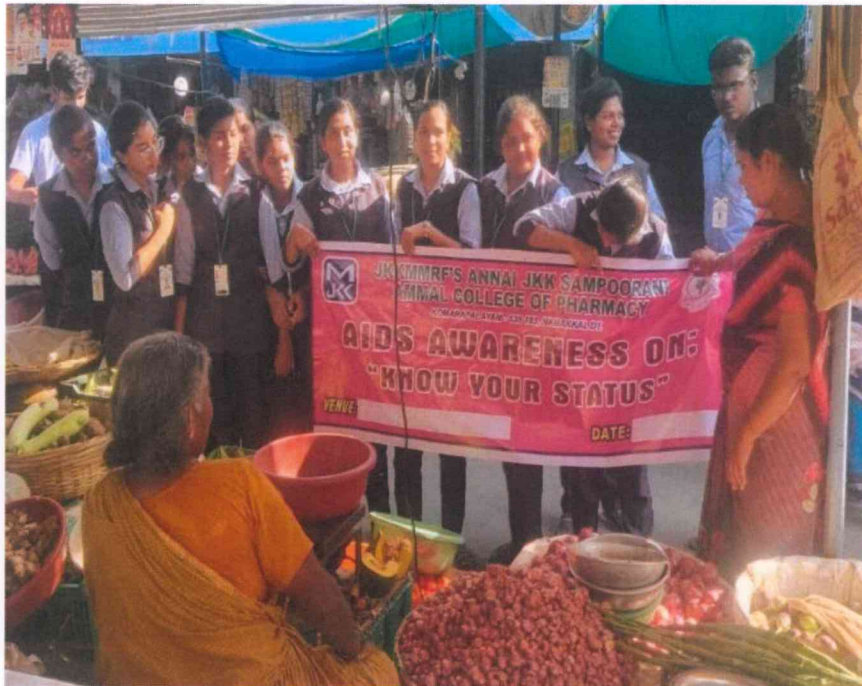
Aids Awareness for public

Ethirmedi, B.Komarapalayam – 638 183, Namakkal Dist. Tamilnadu. India Approved by : Pharmacy Council of India, New Delhi & The Tamilnadu Dr.M.G.R Medical University, Chennai. Website : www.jkkmmrfpharmacy.edu.in |E-Mail : principal@jkkmmrfpharmacy.edu.in Contact No. : +919789456750, +919943069944, +919943066944