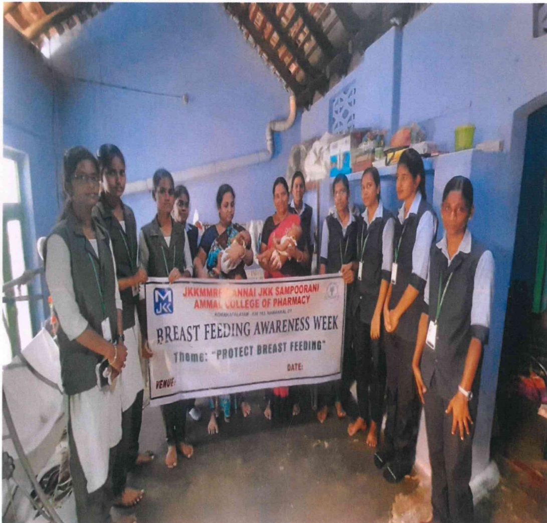
Awareness on Breast Feeding

Ethirmedu, B.Komarapalayam – 638 183, Namakkal Dist. Tamilnadu. India Approved by : Pharmacy Council of India, New Delhi & The Tamilnadu Dr.M.G.R Medical University, Chennai. Website : www.jkkmmrfpharmacy.edu.in | E-Mail : principal@jkkmmrfpharmacy.edu.in Contact No. : +919789456750, +919943069944, +919943066944