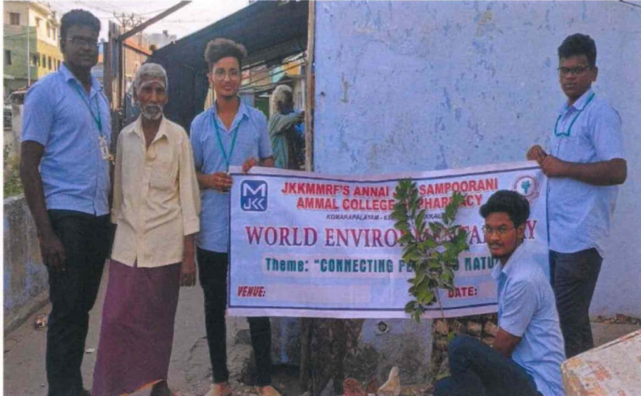
Planting trees on Streets