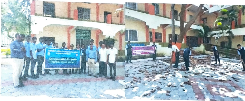
Cleaning the school campus