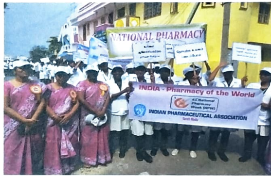
Rally for a Healthier World