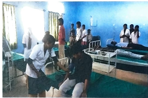
Blood Donation Camp in our college Campus – “Safe Blood for all “