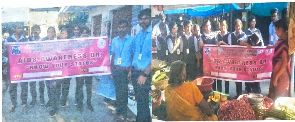
Aids Awareness- Know Your Status