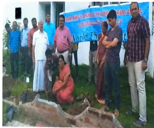
Planting trees on Streets