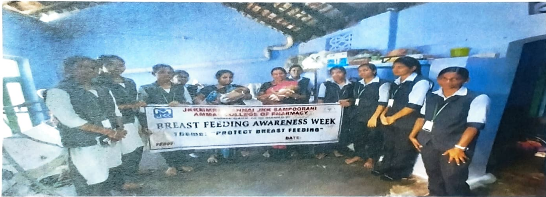
Awareness on Breast Feeding