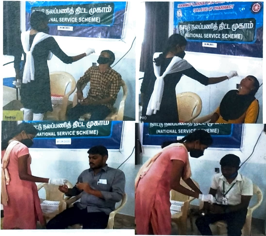
RTPCR-Testing Sample Collection