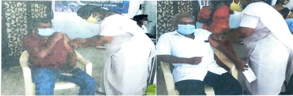
Immunization to Village people