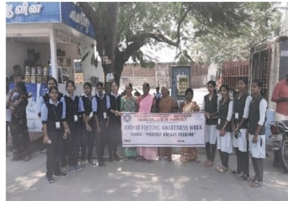
Breast Feeding Awareness in Pallakapalayam Village on 15/07/2018