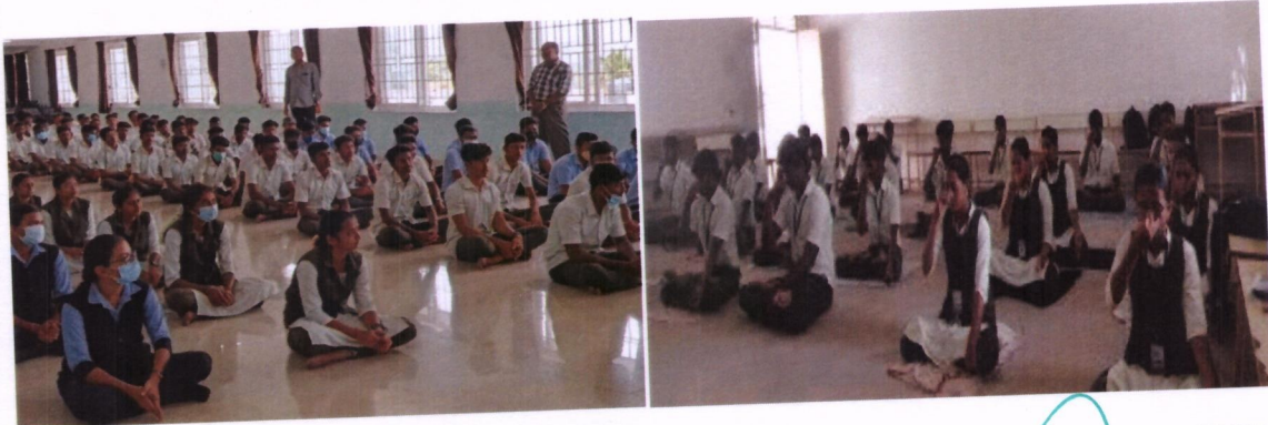
Yoga Day Celebration was conducted by JKKMMRF's College of Pharmacy on 24.06.2017

On 24.06.2017 yoga day celebration was conducted by JKKMMRF'S College of Pharmacy. From this event students get to know about the importance of yoga for the overall health of body, physical and mental health.