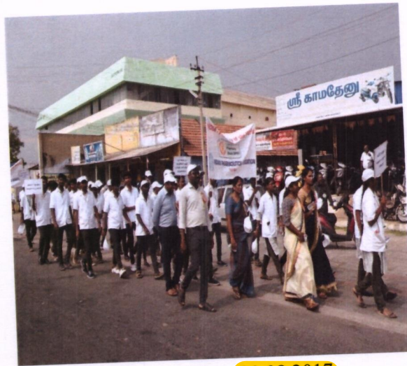
Pharmacist Day Rally was conducted in Vattamalai on 20.08.2017