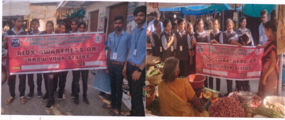
AIDS Awareness given to public people in Thatankutai on 01.12.2018

World AIDS day was celebrated in our college on 01.12.2018 as part of World health day celebrations. The theme of the year 2018 for AIDS was “Know Your Status”. The students in this programme were actively participated for giving proper awareness education for public for the misconception of AIDS. Also, a patient counselling demo session on AIDS was conducted.