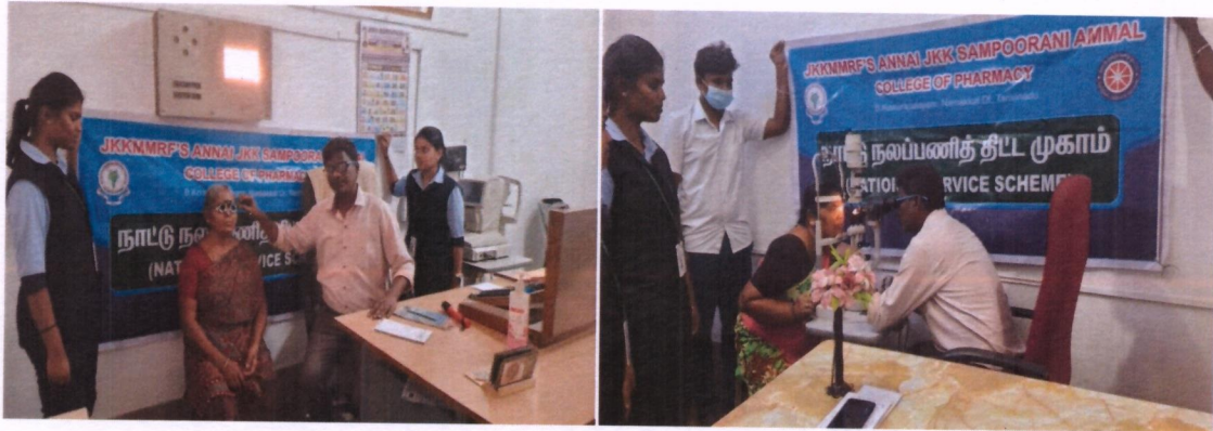
Eye check-up by Doctor in Eye Camp on 06.02.2019 in Komarapalayam

On 06.02.2019 Free Eye Camp was conducted by JKKMMRF college of pharmacy Students. The purpose of conducting is to provide Eye health services to the population in remote and undeserved areas.