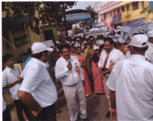
Pharmacist Day Rally in Vattamalai on 22.09.2018