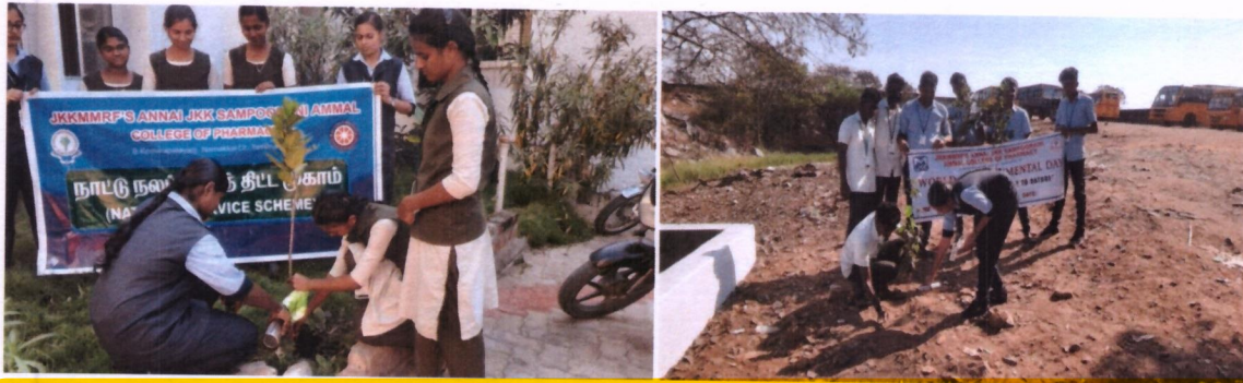
Students planted trees on World Environment Day near college locality, Vattamalai on 05.06.19

On 05.06.2019 World Environmental Day was conducted by JKKMMRF college of pharmacy. our students made an awareness to increase public awareness problems such as wildlife crime, marine pollution growth and global warming.