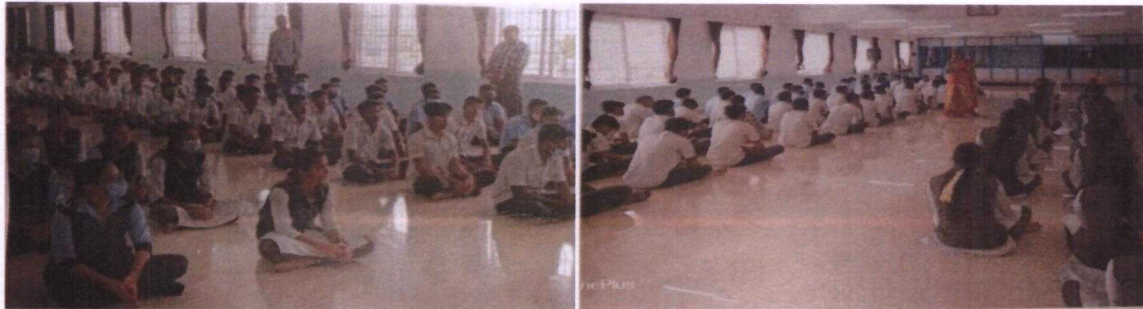
Practicing yoga steps on yoga awareness day in college on 21.06.2020

Our students had conducted an awareness program at JKKM College of pharmacy on 21.06.2020 as a part of the day. Around 250 students of Munirajah School had attended the programme, were various yoga points to be followed to keep our body healthy had discussed in the session.