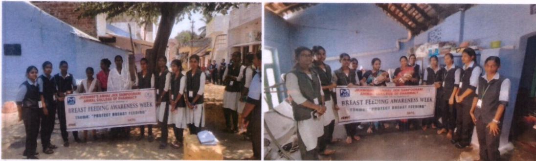
Breast feeding awareness for public in Vattamalai village on 12.06.19

We conducted awareness on breast feeding in Vattamalai village. General public were educated to encourage breast feeding and share its importance to protect the health of mother and baby. Breast feed provides immunity to new born babies.