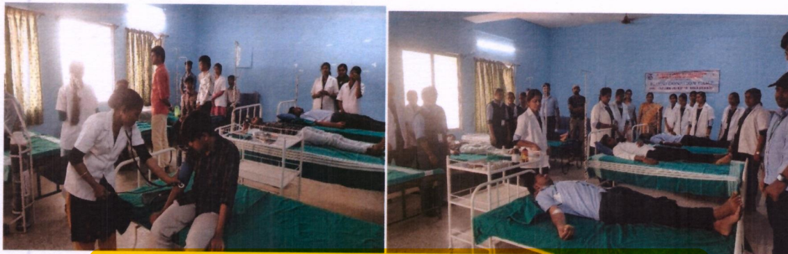
Blood donation was done on 20.08.2019 in Erode Government Hospital

A Blood donation camp was arranged by the NSS student team in Erode Government Hospital. During the camp, 55 donors which includes students and faculty, who were fit to donate their blood had participated in the camp. Totally, 55 units of blood was donated by the team. The agenda of the programme was to create awareness among students, faculties and public regarding the importance of blood donation.