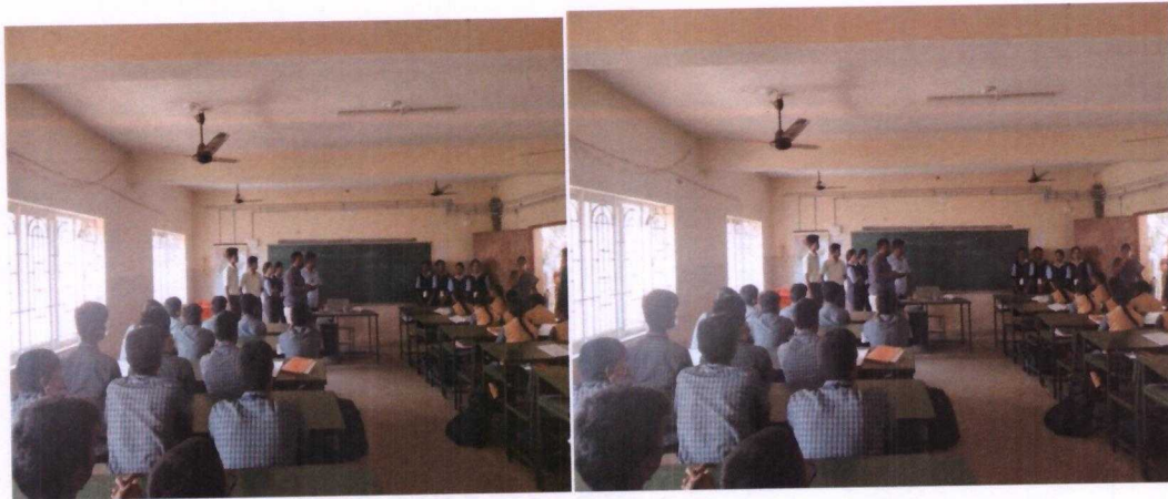
Drug abuse Counselling session at Munirajah school on 25.10.2019

Our students had conducted an awareness program at Munirajah School campus on 25.10.2019 as a part of the DRUG ABUSE day. Around 250 students had attended the programme, were various points to be followed to keep our ear healthy had discussed in the session.