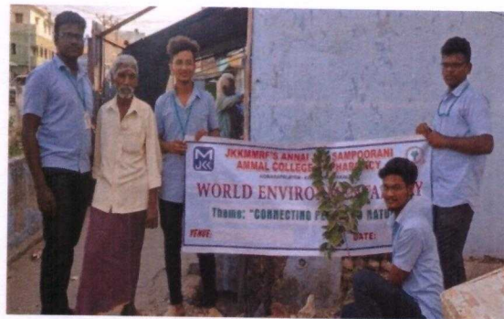
World Environmental day celebrated in JKKMMRF college of Pharmacy, Komarapalayam on 05.06.2022