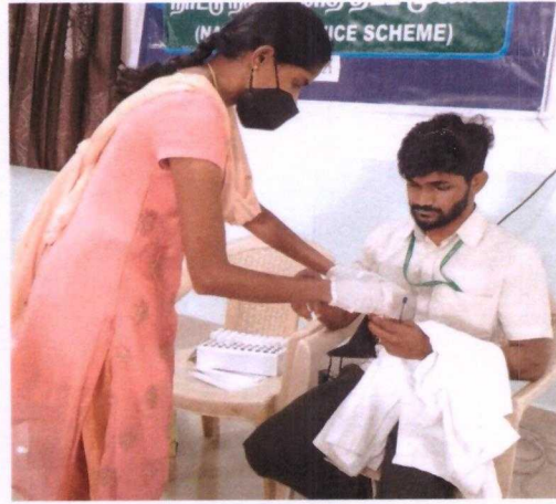
RTPCR Testing Sample Collection was conducted in Government Hospital on 26/08/2021